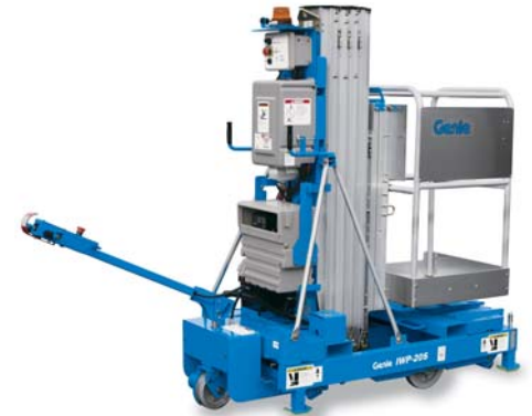
Shown with optional power wheel assist

* Adds 12.5 in (.32 m) to unit length and 285 lbs (129 kg) to unit weight