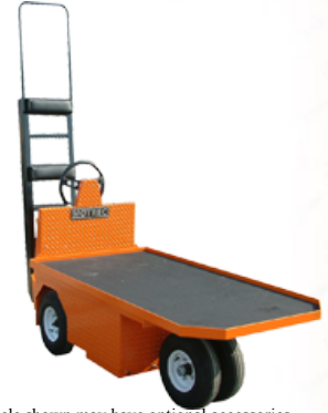
Vehicle shown may have optional accessories