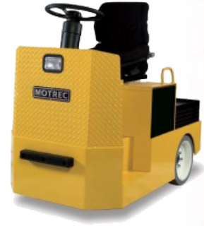
Vehicle shown may have optional accessories